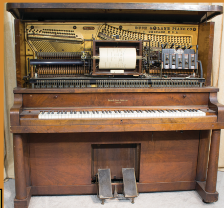
Joplin era player piano 1910 Bush & Lane, Chicago